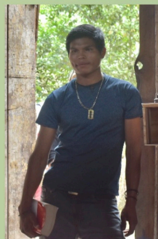
Cabécar man in training for ministry