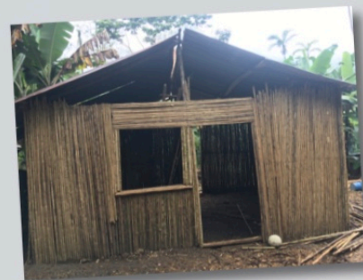
Newly constructed bamboo Cabécar Home

Teaching in the rain has continued to be a challenge for all of us, since we do not have a building to gather under because of the virus restrictions. But we are getting the job done, little by little. Huddling over 40 people into their small home would be dangerous if authorities were to ever find us doing so. The good news is that we are making do with the little that we do have! And as more families have moved into the community, the number of people at these services has grown. Now, there is a greater mixture of professing believers and unbelievers (who show little interest in God or the Bible) which have been added to these meetings. This has given us as believers more opportunities to share about the eternal life available in Jesus Christ, and we have had moments to tell of all the change God does within us as Christians! Cabécar leaders have been sharing of how they view Bible verses as “beautiful”! At a recent service, a woman quickly spoke up and said, “the New Testament began in history after Jesus came to earth”! After asking her if she spent a lot of time studying the Bible, she commented, “Yes.” On another occasion, one man said to those of his family, “Let’s come to our church services for the right reasons, to hear from God through the Bible, and not come to get things like food or anything else.” What a joy it is to see these families walking and learning in the way, the truth, and the life of the Lord!