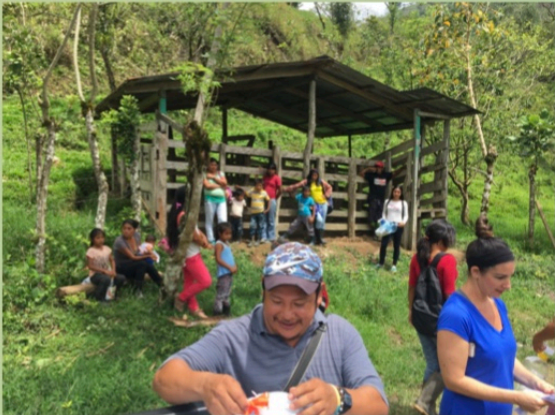
Passing out the bags of food in Nimari