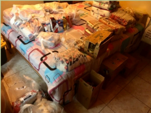
Preparing the bags of food for Cabécar

Thank you so very much for every gift that you have given to help continue the work of the Gospel to the Cabécar in the mountains here in Costa Rica! Thank you for all the hard work you do there in the United States of America! It is our privilege to be missionaries here to the Cabécar in planting churches, training leaders for the ministry, teaching the Bible to the saved, and sharing the Gospel of Jesus Christ to the lost souls! We constantly thank God for giving us such great partners like you to help us carry out this work!