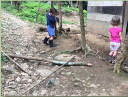
Our children playing at Atirro ministry