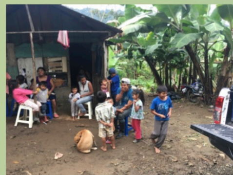
Cabécar family members fellowshipping after the message