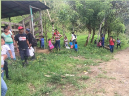
Nimari Cabécar waiting for bags of food

Restrictions are beginning to lift in small ways, which will allow for us to soon make another visit to the Nimari area! The leaders that we have spoken with are ready and planning for us to return to gathering together for teaching and fellowship as before. When this does happen, everything will be done outside under a pavilion, keeping social distance as much as possible. But our next visit will have to be a small one, and most likely we will not gather together for our normal services, but minister in a different way. This is certainly not what we want and nor is this what the Cabécar Indians want, but this is what is mandated for the time being. We have been asked by a few leaders to trek with them to take a look at a small bridge that they plan to protect with paint. Months ago, they requested this paint from us to be used on the primary bridge leading into their community, but they now desire to use the paint for another bridge which is used most often and is in more urgent need of paint. And because of your faithful gifts and monthly support, we together were able to provide the paint for this purpose!