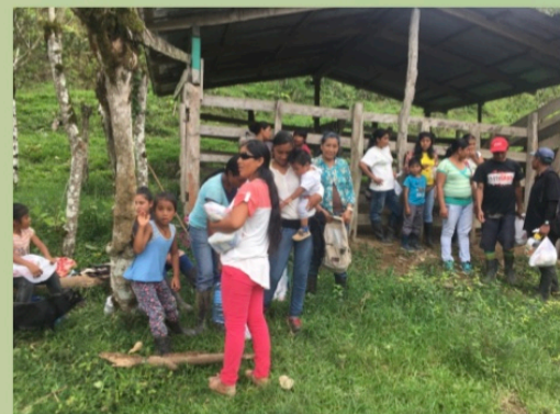
Cabécar in Nimari receiving food

A mid restrictions due to the virus, we have continued to keep in contact with the Nimari Cabécar community. They expressed to us that a large portion of the people were without work. As a result of this lack of work, many families have been in need, and they could use any form of help that we or others could provide to them. Though we could not go all the way across the bridge into to the center of their community as we normally do, we were able to drive and deliver around 60 bags of basic food items for 60 Cabécar families in need, and give to each of them John 3:16 in written form in Spanish and Cabécar.